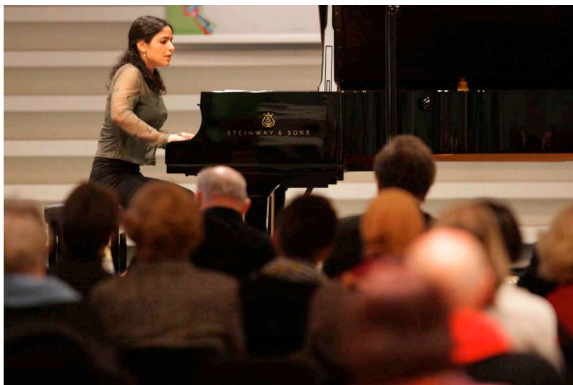
First Round Telekom Beethoven Competition 2009