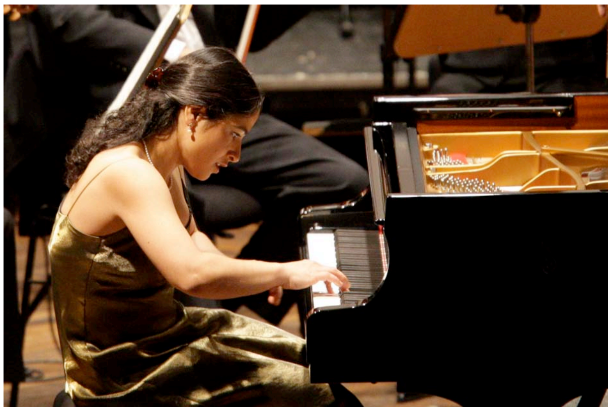
Final Telekom Beethoven Competition 2009